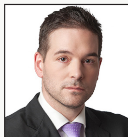
KEVIN NASH SIAC